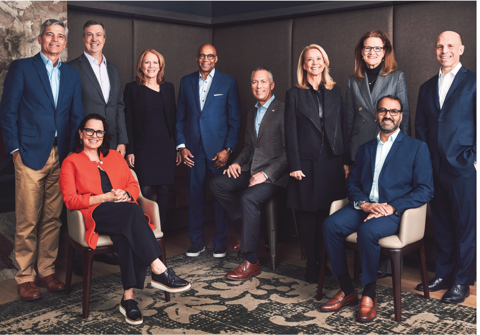
Pictured from Left to Right